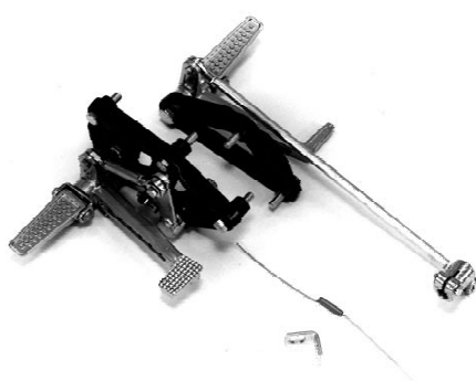
Suzuki GSF 600 BANDIT