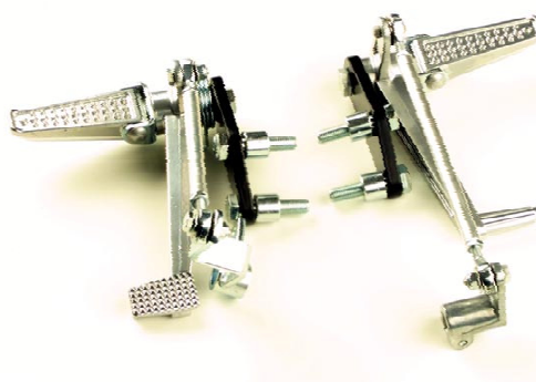
1995 Triumph Bonneville, 2001