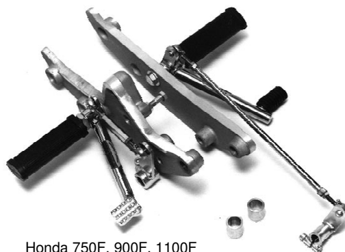
Honda 750F, 900F, 1100F