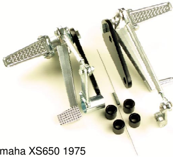
Yamaha XS650 1975