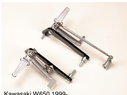
Kawasaki W650 1999-