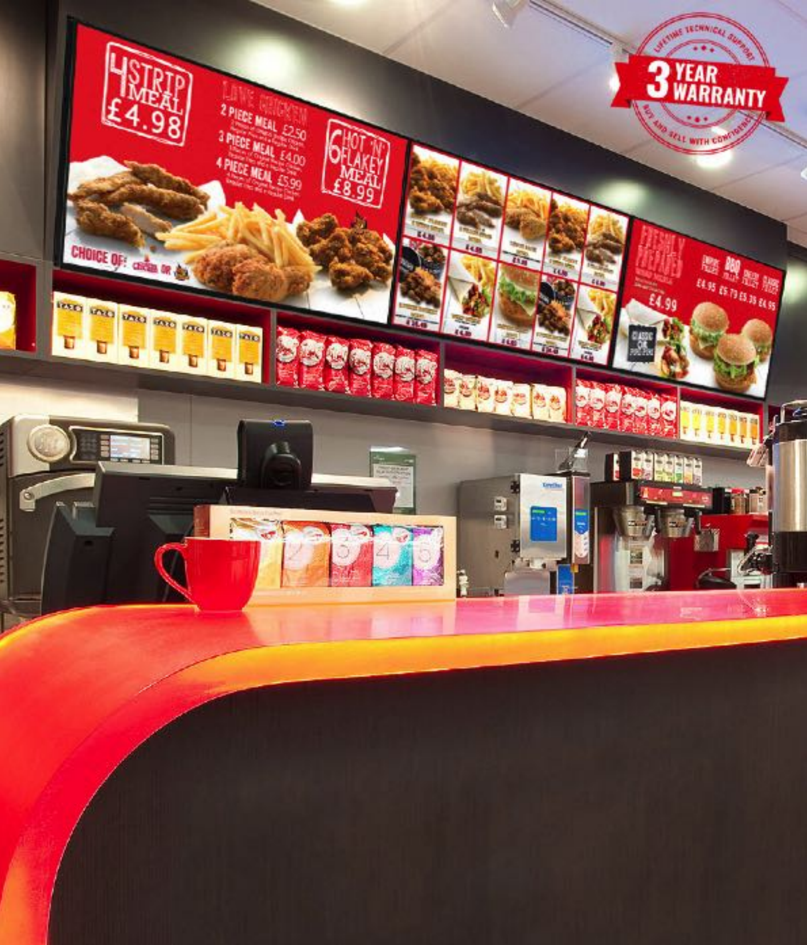
50" Network Digital Menu Board